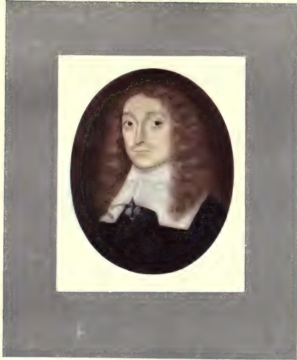
JOHN MILTON ARTIST UNKNOWN